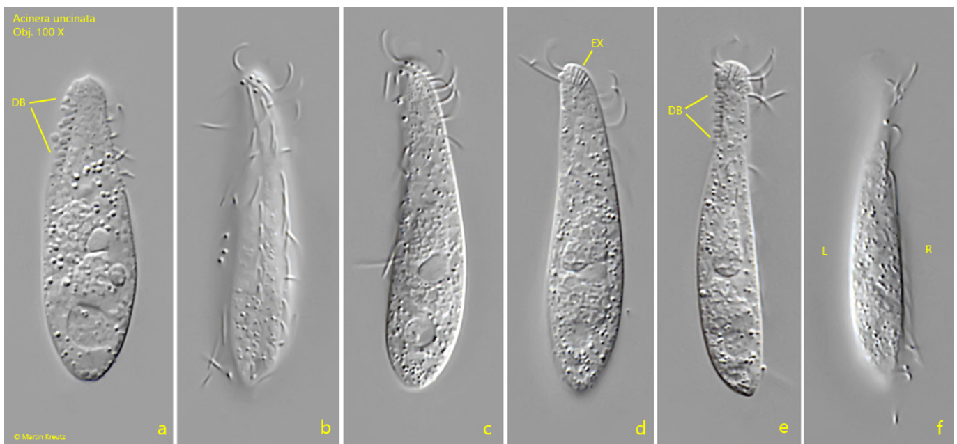
Fig. 2 a-f: Acinera uncinata . L = 36 \mu m. A second freely swimming specimen from right (a-d) and from dorsal (e, f). DB = dorsal brush, EX = extrusomes, L = left side, R = right side. Obj. 100 X.