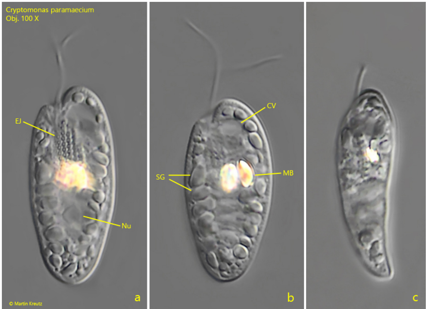
Fig. 2 a-c: Cryptomonas paramaecium . L = 26 \mu m. A freely swimming specimen in frontal view (a, b) and lateral view (c). CV = contractile vacuole, EJ = cytopharynx with ejectisomes, MB = Maupas' bodies, SG = starch grains. Obj. 100 X.