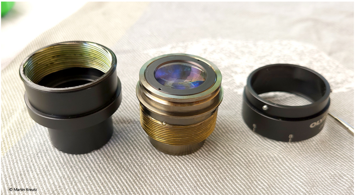
Fig. 6: Once the gun oil has dissolved the resinified grease, the brass sleeve can be unscrewed.

Now the threads must be thoroughly cleaned. I use spirit (denatured alcohol) and cellulose wipes for this. The old grease is greenish due to dissolved copper ions (s. figs. 7 and 8).