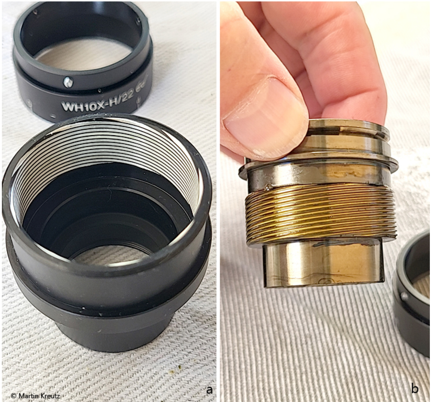
Fig. 8: The worm threads after cleaning.

After cleaning the threads, the field lens must be cleaned, as it is no longer easy to access it once the eyepiece has been reassembled. To do this, I use standard glass cleaner from the supermarket and two microfiber cloths (s. fig. 9). The first cloth is for pre-cleaning to remove coarse dirt and the second cloth is used to remove any remaining dust grains and fibers from the glass surface.