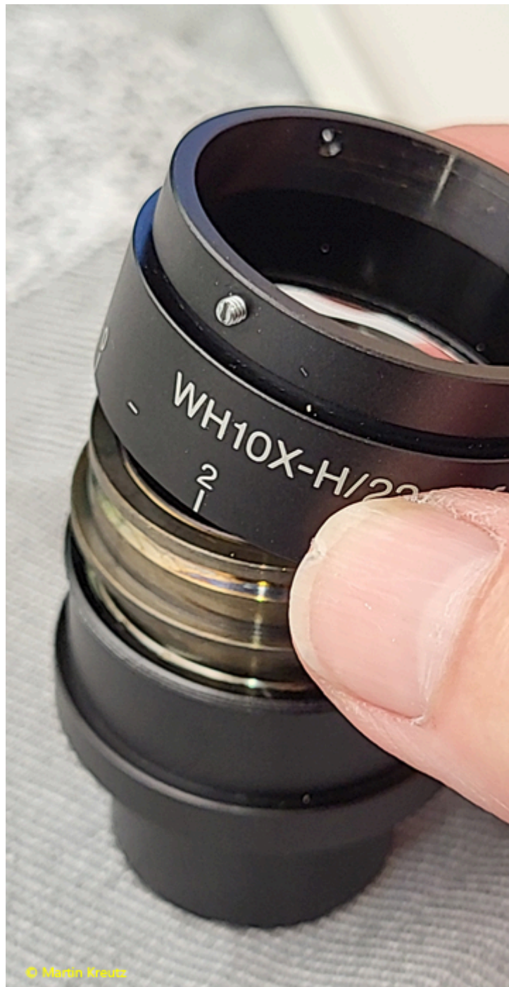
Fig. 3: Remove the upper aluminium sleeve after loosen the grub screws.