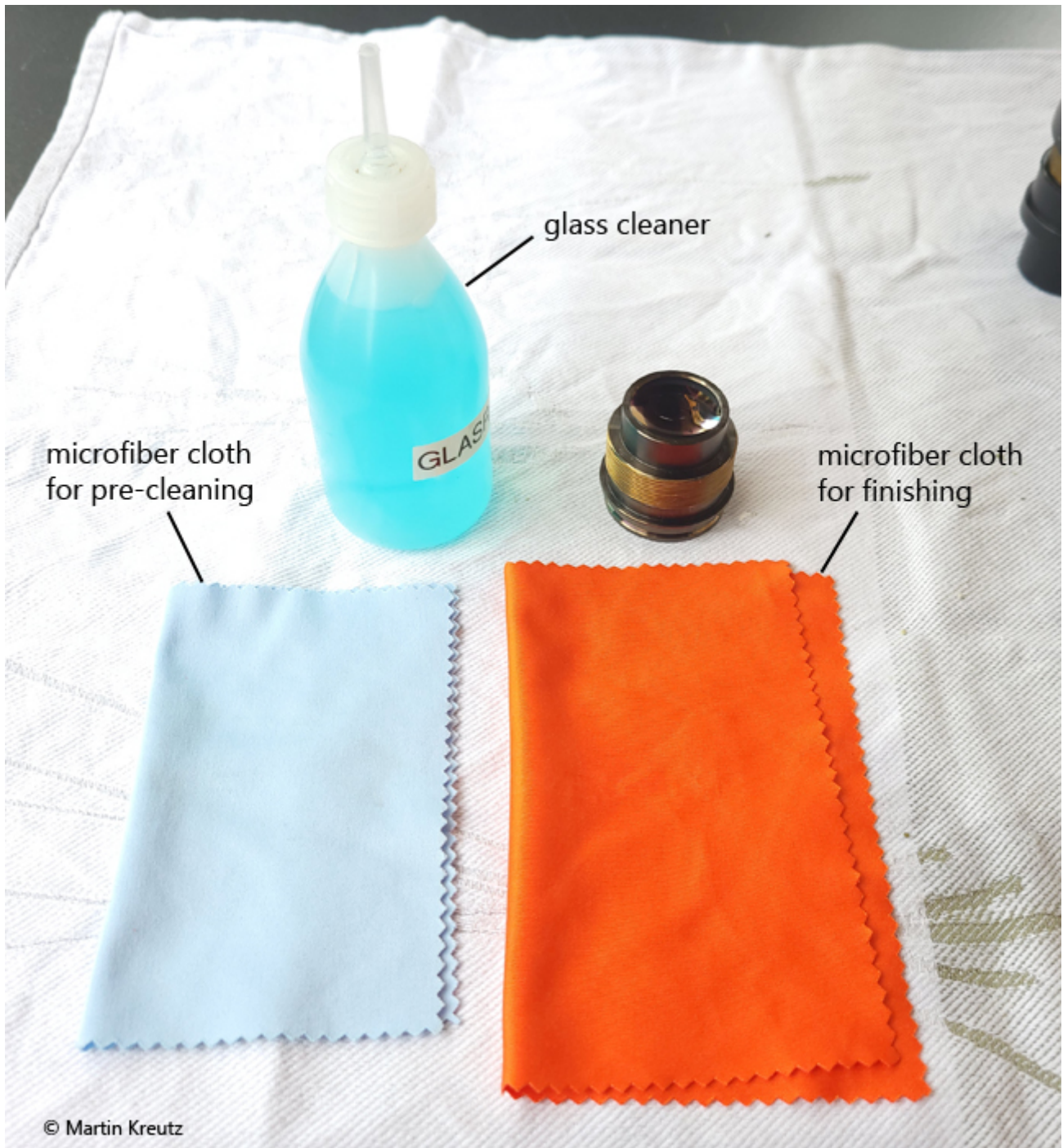
Fig. 9: Standard glass cleaner and two microfiber cloths for cleaning the lenses.

First I moisten the cloth with the glass cleaner for pre-cleaning (not too strong). Then I wipe it over the glass surface once or twice in one go. Do not try to rub. If streaks are still visible afterwards, repeat the process with an unused part of the cloth. Now take the second cloth for subsequent cleaning and breath on the cloth (not the glass surface). This only moistens the surface of the cloth very slightly. Wipe the glass surface in one go. All fibers and dust particles will stick to the slightly moistened microfibers. If any residue remains, repeat the process with an unused part of the cloth. The glass surface is then completely clean (s. fig. 10).