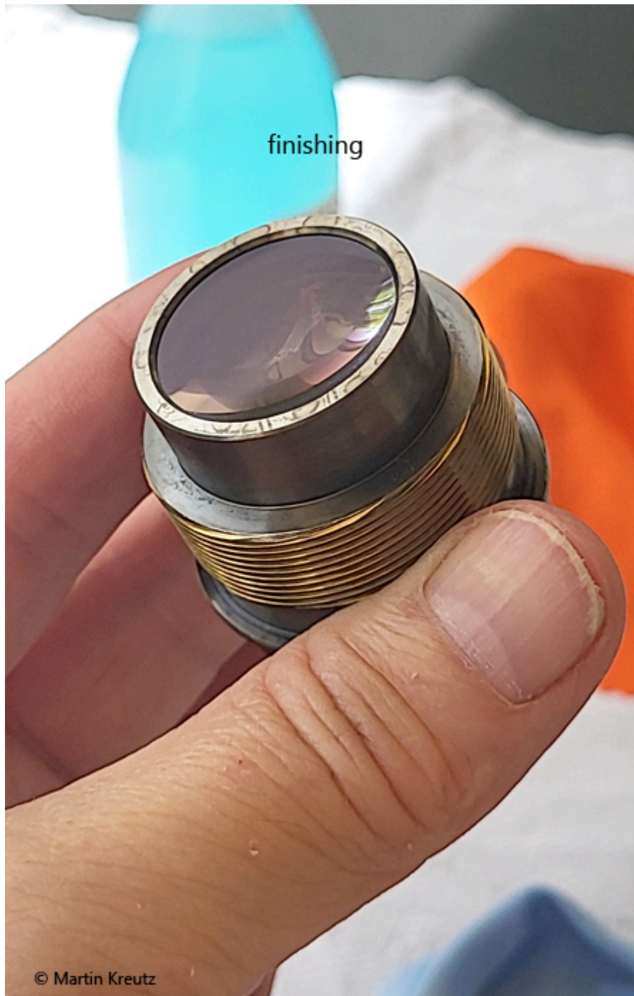
Fig. 10: The cleaned field lens.

The worm thread can now be regreased. To do this, I use silicone grease, which is resistant to oxidation and resinification. I use commercially available silicone grease from DIY stores or online retailers. I use a toothpick to apply the grease. The silicone grease must be applied sparingly (s. fig. 11 a-b).