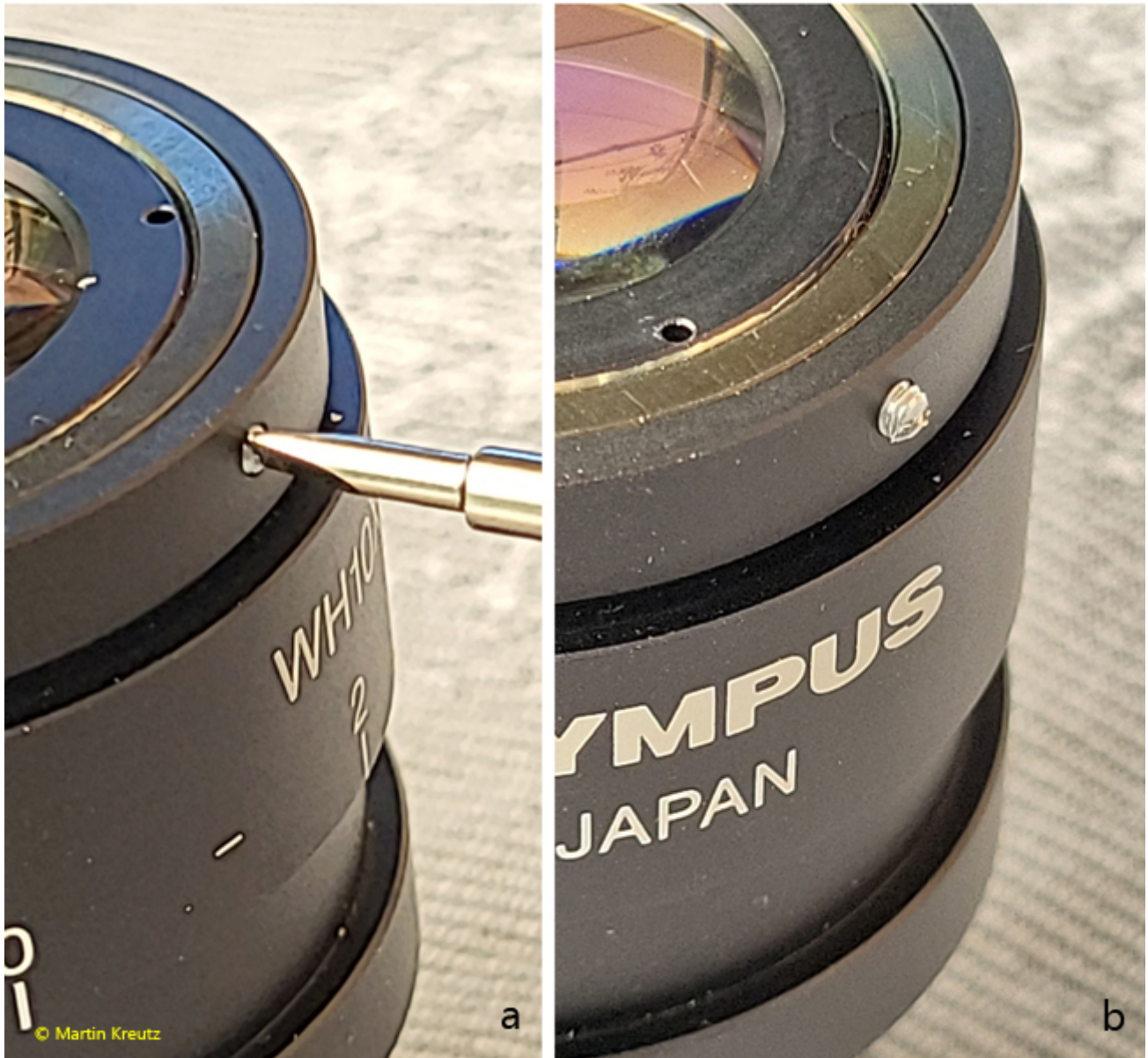
Fig. 2 a-b: Do not loosen the grub screws so far that they fall out.

After loosening the grub screws, pull the sleeve up slightly and then unscrew it from the thread. It can only be removed when it is unscrewed (s. figs. 3 and 4).