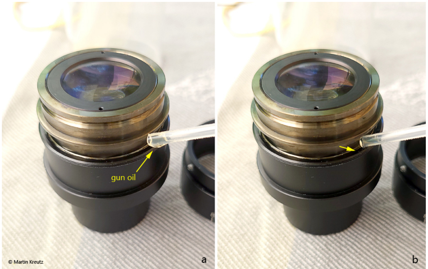
Fig. 5 a-b: The loose the worm thread some droplets of gun oil (a) are transferred in the slit between brass sleeve and the black aluminium sleeve (b, arrow).

After waiting for about an hour, carefully try to turn the worm gear for the first time. If it is still too stiff, wait another hour. If it moves easily, turn it carefully back and forth so that the gun oil is distributed more quickly. If it moves smoothly enough, you can unscrew the brass sleeve (s. fig. 6).