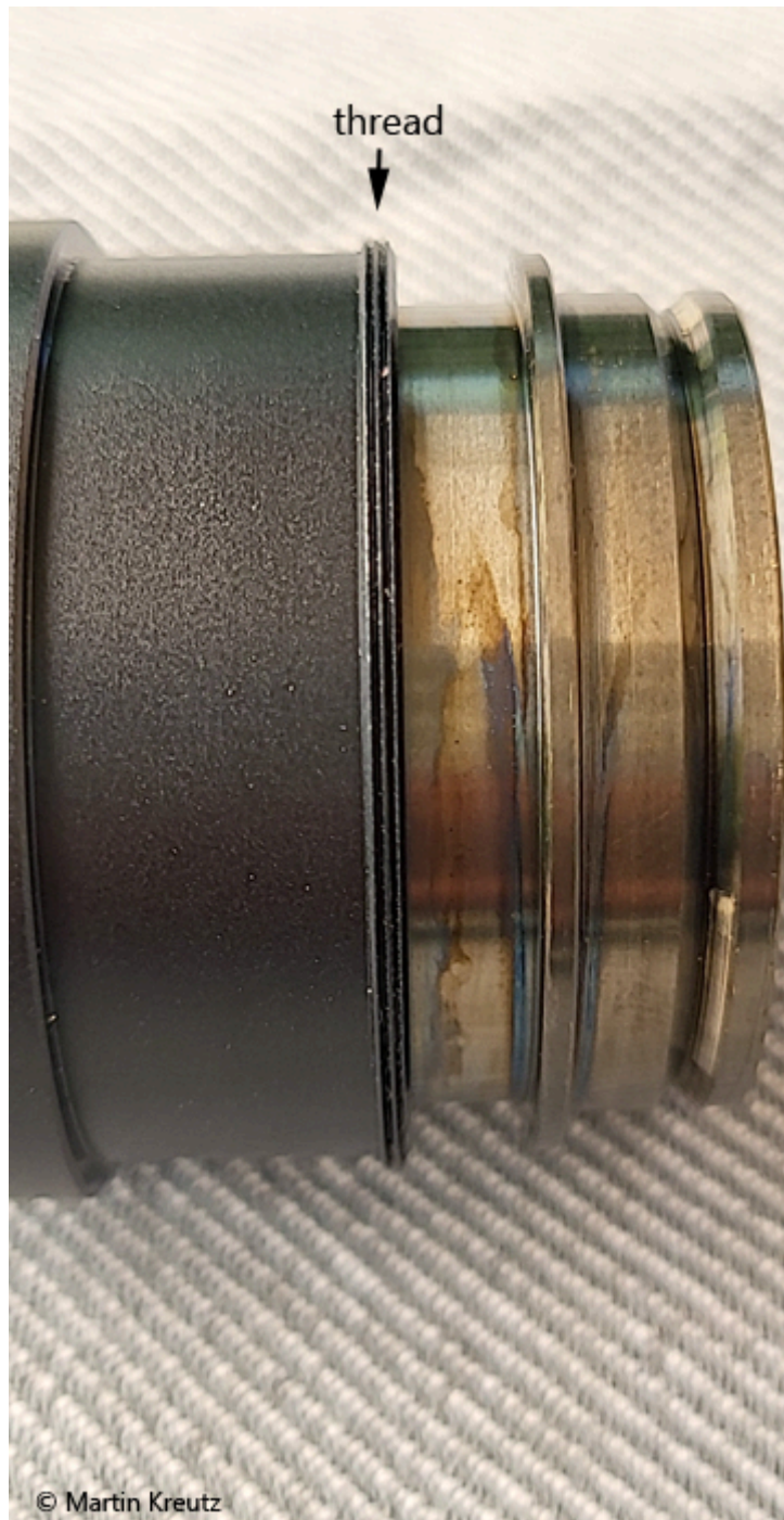
Fig. 4: The thread for tightening the upper sleeve becomes visible (arrow).

The brass sleeve with the lens group is now visible, but cannot yet be unscrewed due to the seized worm thread. I now put a few drops of gun oil (I use "Ballistol") into the gap between the brass sleeve and the lower aluminum sleeve (s. fig. 5 a-b).