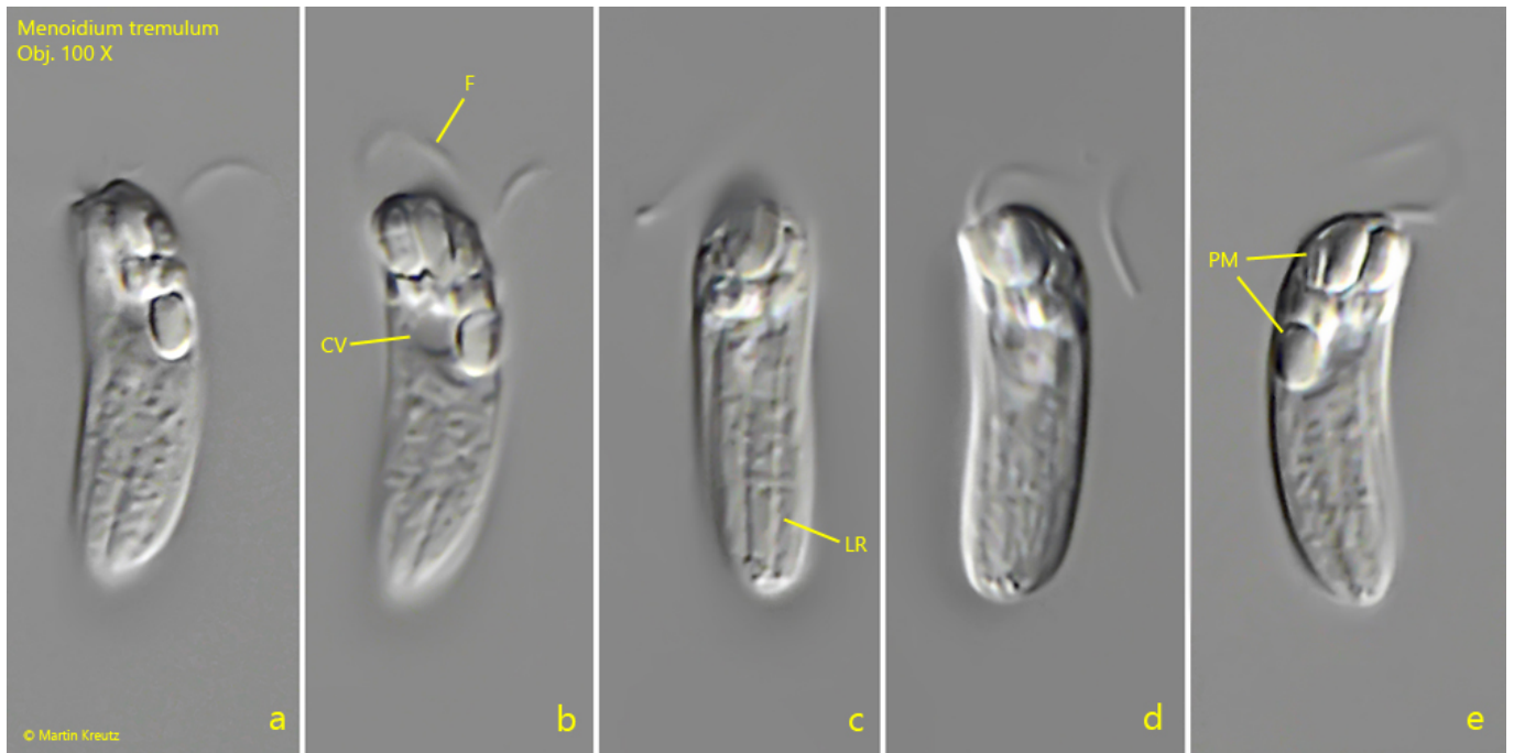
Fig. 1 a-e: Menoidium tremulum . L = 16 \mu m. A freely swimming specimen. Note the longitudinal ridges of the pellicle (LR) and the contractile vacuole (CV) in the anterior third of the cell. F = flagellum, PM = paramylon grains. Obj. 100 X.